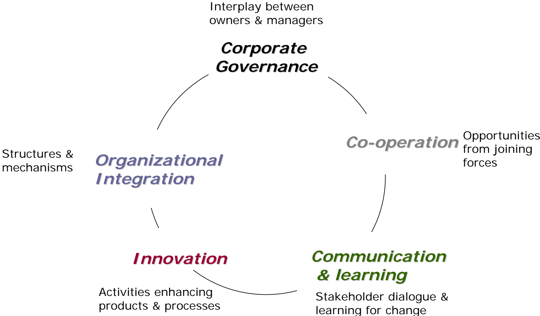
Fig. 1: Five focus areas for sustainable development